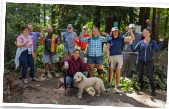
LEFT: Community Foresters First Fridays: Volunteer stewards have done amazing work in Marine View Park on the first Fridays of each month. Friday, August 4th they commemorated their hard work with a picture in front of the large debris pile of noxious plants and weeds consisting of Himalayan blackberry, English ivy and invasive laurel.