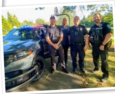
RIGHT: National Night Out: Normandy Park Police Department hosted neighbors again this year at National Night Out on August 2 at City Hall. Residents got to see the police motorcycle and get up close to a police vehicle. Every year the department hosts National Night Out at City Hall on the evening of the first Tuesday in August. Join us for pizza again next summer!