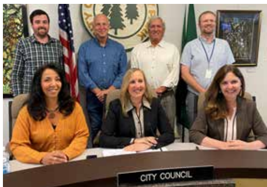
Normandy Park City Council

of the homepage: https://normandyparkwa.gov/